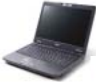
Acer Extensa 4230 (with Bluetooth & Webcam)